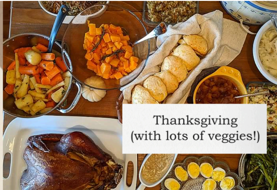
Thanksgiving (with lots of veggies!)

The mountains are our favorite place to be. Our shared favorite food is sushi! We love going to college football games (or watching on TV).