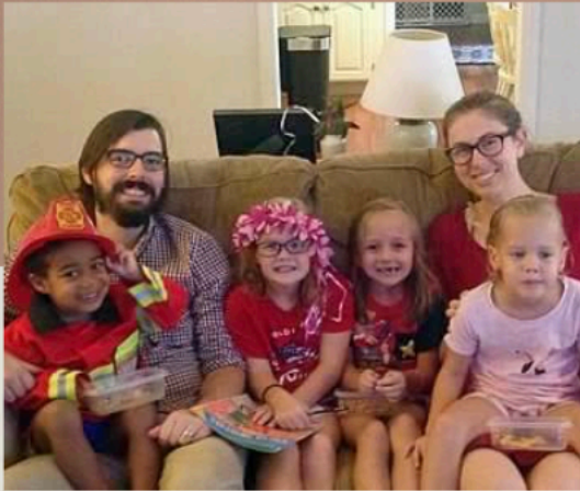
Reading Andy's Cousins' a Bedtime Story