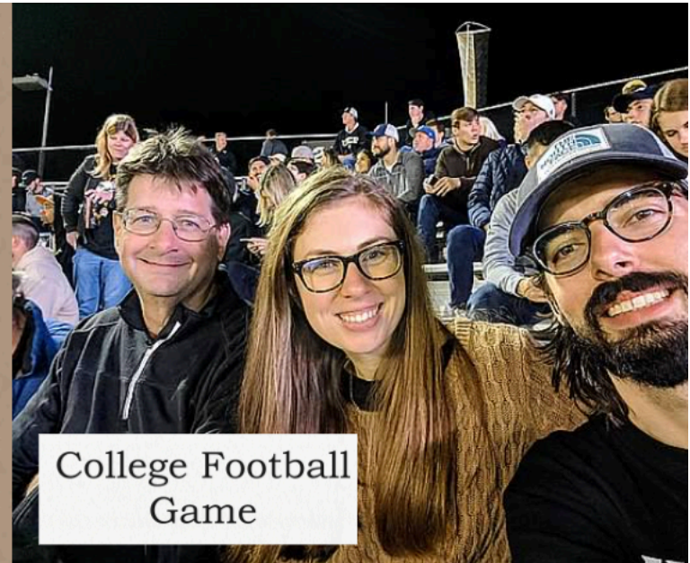
College Football Game