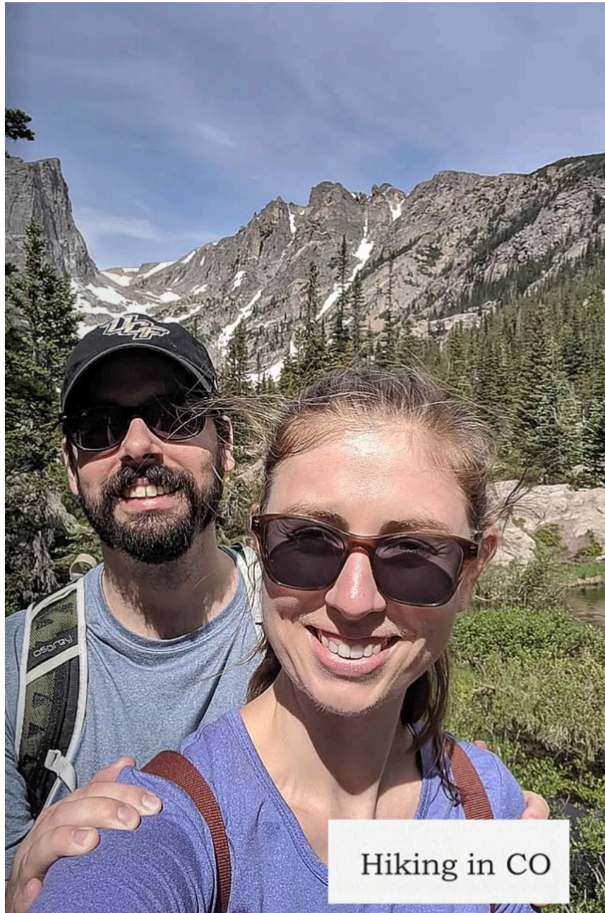
Hiking in CO